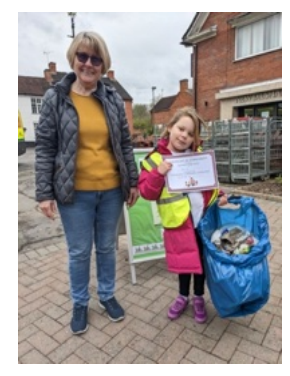
AVS Annual Report March 2024